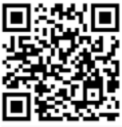
Golf & Tennis