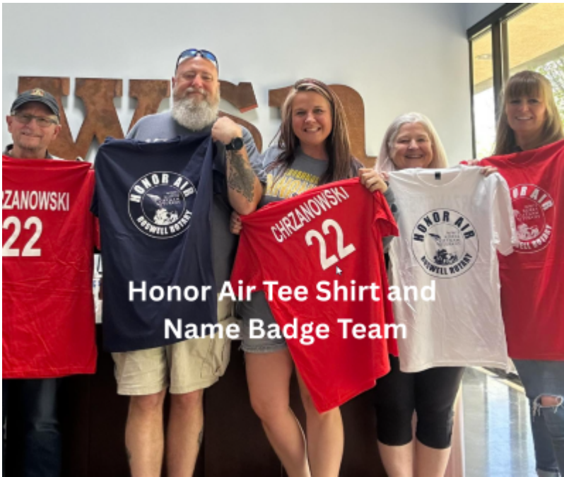
Honor Air Tee Shirt and Name Badge Team