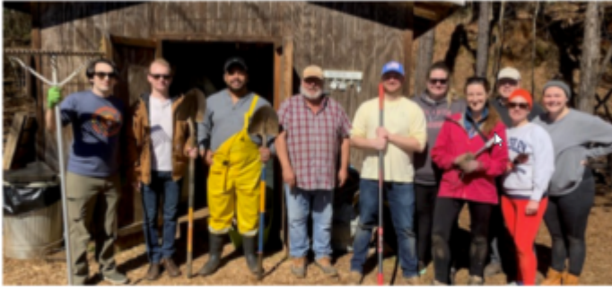
The Roswell Rotary After Hours Club working on the Unity Garden at the Chattahoochee Nature Center.

Roswell Rotary supports environmental sustainability through its After Hours Club, which repurposes plastic grocery bags to aid produce transport from the Chattahoochee Nature Center's Unity Garden to the North Fulton Community Charities local food pantry. The group also actively participates in Georgia's annual "Sweep the Hooch" river cleanup and other city park beautification projects.