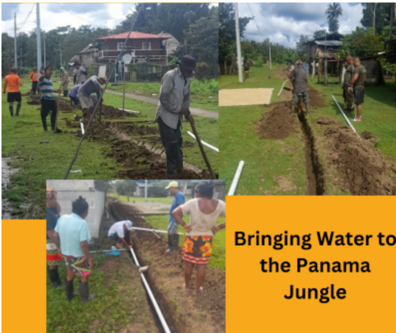
Panama Clean Water Global Grant - Work continues on our Global Grant