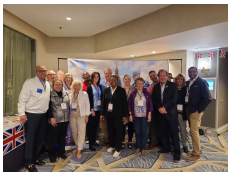
District 6900-PDGs, DG, DGE, DGN & Emerging leaders.