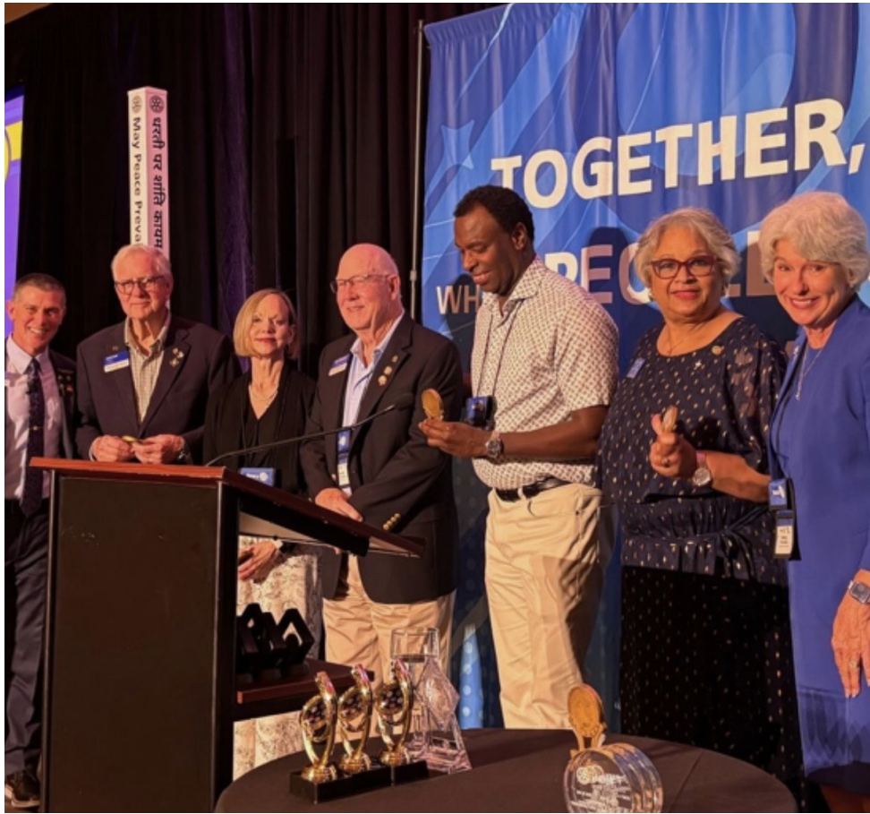
Many thanks to our members who were able to be there to help celebrate our success and commitment to serving our community!