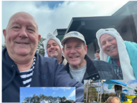
Polar Plunge Pix