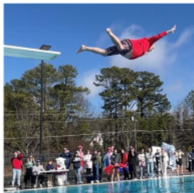
District Governor Belly Flop King at Polar Plunge