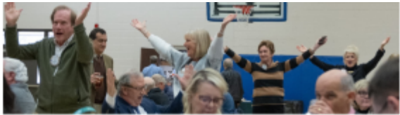
Dancing to Get the Meeting Started