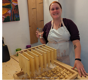
Thursday, Sept. 5