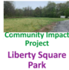
Liberty Square Park Cleanup 8am - 12pm See Gabriel Prado

We need help on September 16th! Starting with our Liberty Park Clean Up, to Rivers Alive Cleanup, and then 9/11 Cookout! What times can you sign up for?